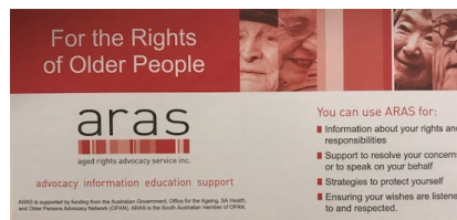
For The Rights of Older People