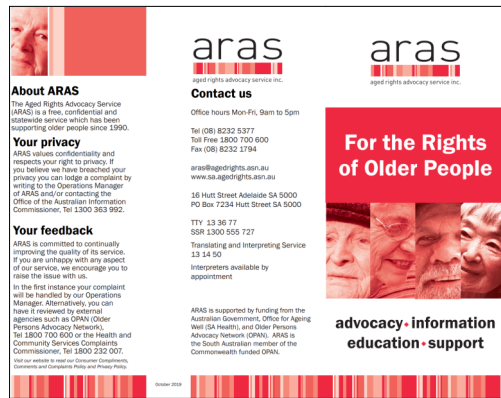
For the rights of older people tri-fold brochure