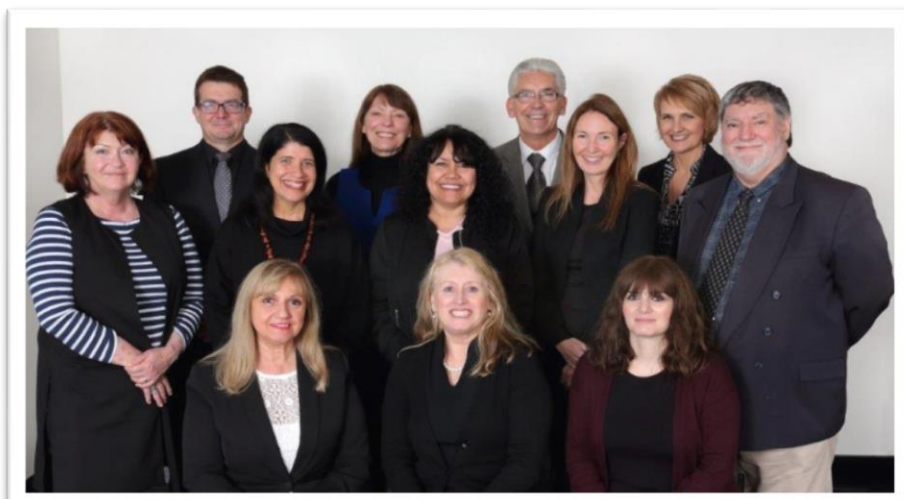
The ARAS Team

ARAS is supported by funding from the Australian Government and Office for the Ageing, SA Health and is one of a nine-member organisation of the Older Persons Advocacy Network (OPAN).